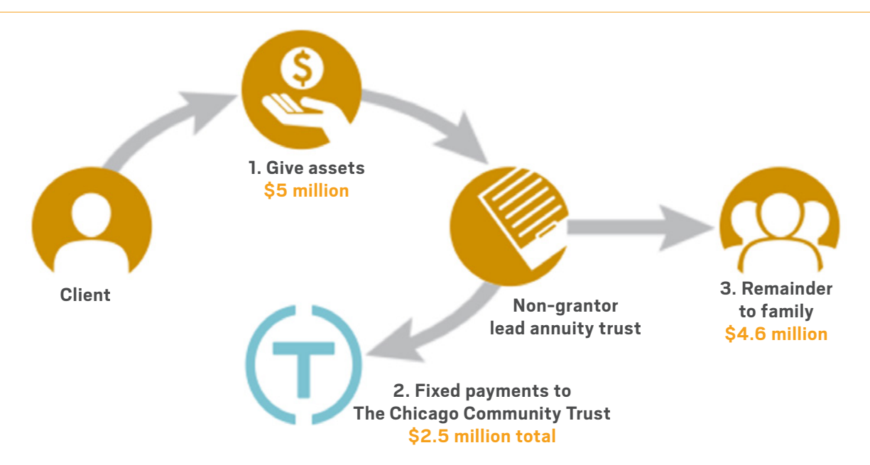
Figure 1: Non-Grantor Charitable Lead Annuity Trust for 10 Years<sup>1</sup>

In Example 1, the client moves $5 million of a low-basis asset out of her estate and in 10 years, transfers whatever is left in the trust to her children. The projected results are as follows: