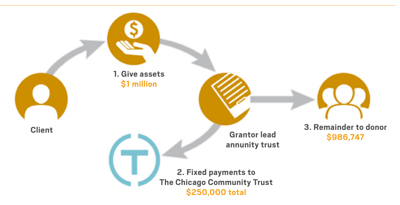
Figure 2: Reversionary Grantor Charitable Lead Annuity Trust for 5 Years<sup>9</sup>

In Example 2, the client takes a low-basis asset worth $1 million, transfers it to a CLAT for five years, and gets back whatever is left in the trust. The projected results are as follows: